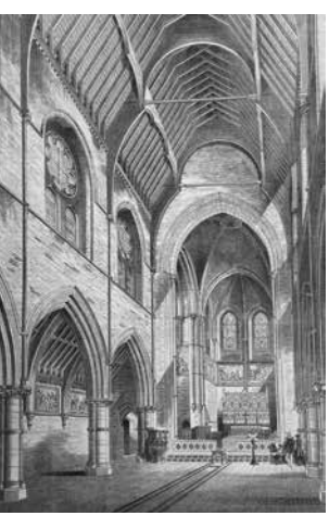
Clockwise: St Columba Church, clergy house and schools, painting by Hundleby 1977; The Builder , 11 December 1869; and St Columba Church, clergy house and schools. Lithograph, Building News , 28 February 1873.

£10,500. The reason for the extra cost was partly structural difficulties with the nave piers. Brooks designed these of brick but settlement necessitated the replacement of brick by stone'. And so decorative elements were in fact omitted to achieve savings.