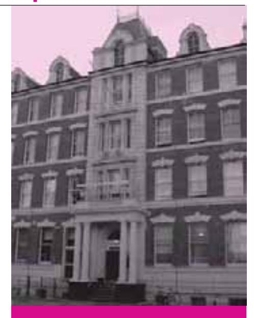
St Leonard's Hospital will become one of the government's new polyclinics

The project, From Fever to Consumption – the Story of Healthcare in Hackney, will look at how these institutions developed and the significance of their architectural design. We also plan to train volunteers in oral history techniques so they can interview former doctors, nurses and patients to help inform this study. Over the next 12 months we will also be organising special walks, tours and creative writing sessions; and developing a community history website and online education resources for teachers.