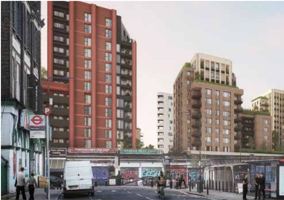
Dalston Shopping Centre CGI of proposed development seen from St Mark's Rise with Ridley Road in the foreground. Picture provided. See comparison image.