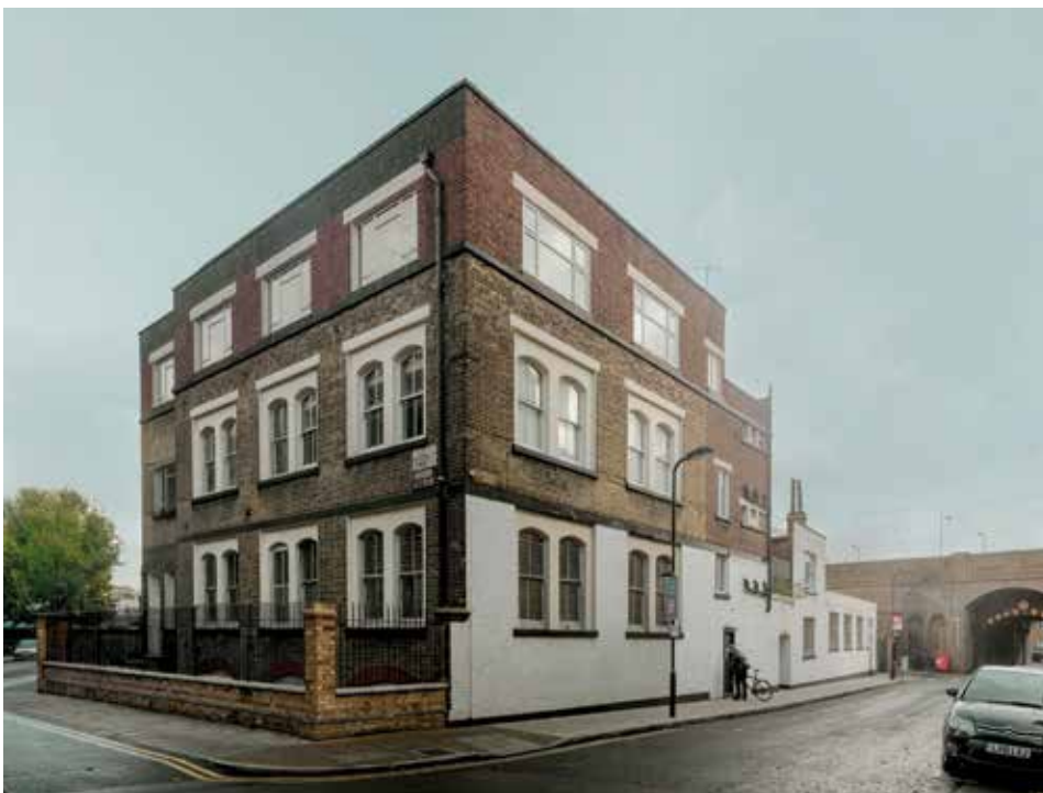
SPACE in Martello Street.

Martello has a very special place in our hearts and history, so after having been