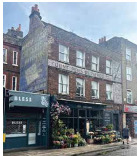
113 Stoke Newington Church Street has the rare honour of being nationally listed (as an 18th-century building) and locally listed (specifically the ghost signs on its front elevation). Something to bear in mind for a local history round of a Hackney pub quiz?

BARG is also open to being contacted about historic features absent from the