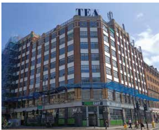
Tea Building.

The original Lipton Tea Factory, as it was initially known, was actually a state-of-the-art bacon curing plant built on the site of a tea storage facility, hence the name. The bacon factory, and an adjoining warehouse