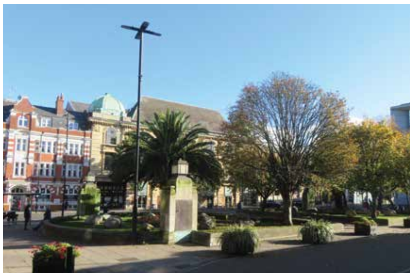
Hackney Town Hall Square.

"The Grade II listed walls and lamp piers that form a substantial part of the Town Hall Square are both a heritage and a community asset. The overarching aim of the project is to create a more inclusive space which supports diverse community uses, underpins the square's civic and political role and promotes climate resilience and sustainability," the listed building consent application says.