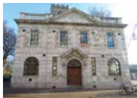
The Old Town Hall before rebranding by Gail's as Hackney Castle.

Gail's has applied for listed building consent for a range of changes to the building, including signage which was erected before a decision was made. Other changes relate to grilles and ventilation as well as internal fittings and a sump pump to deal with basement flooding.