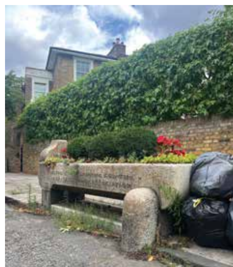
The drinking trough near the junction of De Beauvoir Road and Stamford Road in De Beauvoir.

The project is still being formulated and further details will be announced in due course. If you have an interest in or information about a particular trough, or troughs in general, please email