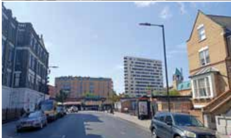
Dalston Shopping Centre proposed development. Picture provided