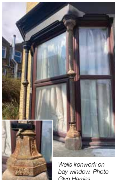
Wells ironwork on bay window.

The houses with the iron columns on Linscott Road were built after 1882, on a new road leading to the Salvation Army's National Barracks. The barracks occupied the portico, which was all that remained of the London Orphan Asylum dating from 1823. After the Salvation Army bought the building, the surrounding area was developed.