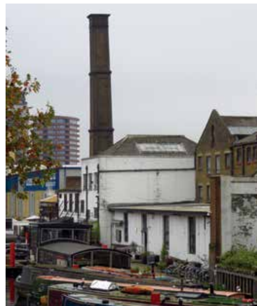
Left: Holborn Studios Eagle Wharf Road entrance. Photo Paul Bolding. Right: Holborn Studios from the canalside showing the historic chimney. Photo Paul Bolding